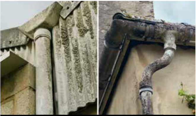
Asbestos cement downpipe and corregated asbestos sheet

Asbestos cement has many uses inside and out, and can be found in many places including: