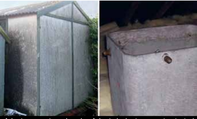
Asbestos cement panels and roof sheets / asbestos cement water tank

Although non-licensed work, appropriate training is required to work on these materials. See the asbestos essentials task sheets (<u>https://www.hse.gov.uk/asbestos/essentials/index.htm</u>).